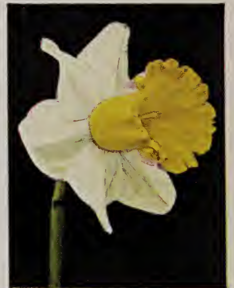
NARCISSUS SPRING GLORY